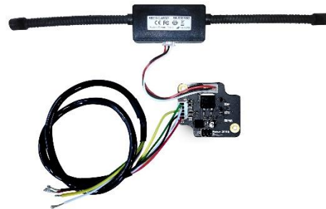
Non housing version