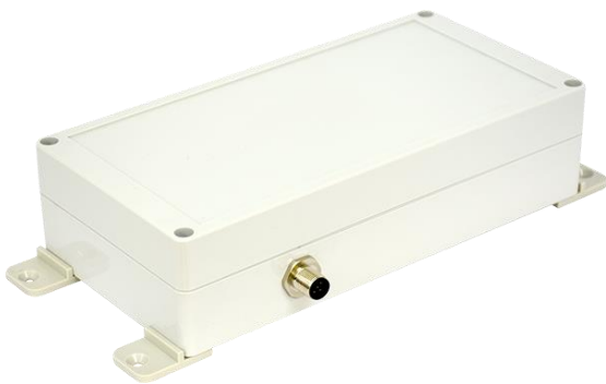
ABS housing version