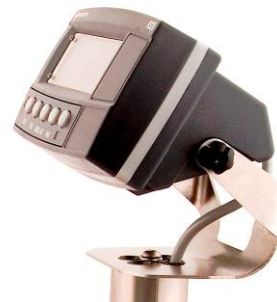
A10018 Insert for Pole Mounting