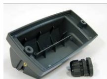
M3003 IP65 Desk Mount