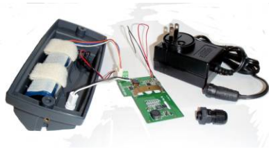
M3103 IP65 ABS Desk Stand and Battery Pack, NiMH 2.5 AH