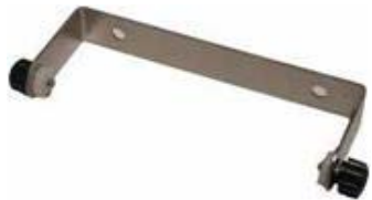
M3002 Wall Mount