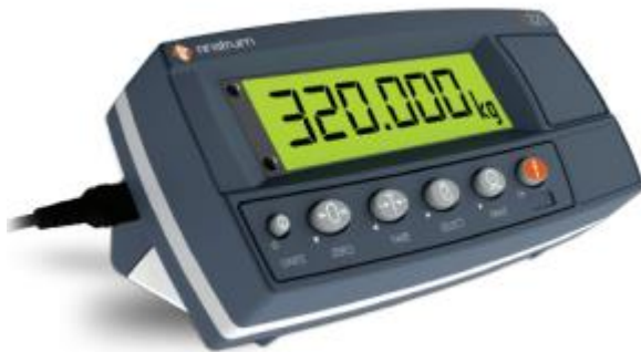
4AA Battery Version