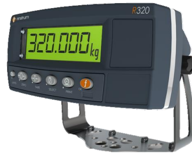
IP65 M12 Connector Version