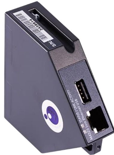
The M4223 Lua Module

For more information, visit the Lua Programmable Indicators page on the Rinstrum Website.